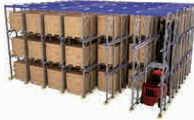
AR DRIVE IN