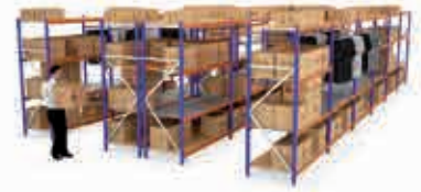
AR LS (LONGSPAN)